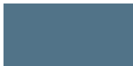
*HAWAIIAN BLUE TSR = .33